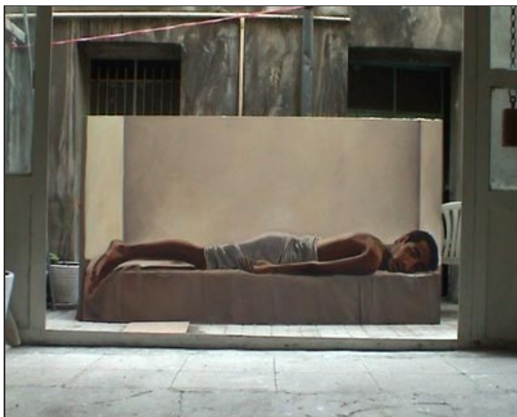
Ahmad Morshedloo, «Untitled», documentation on paintings, 2006.

TREIBSAND VOL. 01 sheds light on contemporary and emerging art in Tehran , concentrating predominantly on an analytical stance in times of waiting. Waiting for the future may be expressed as yearning or depression, or it may appear as a long, protracted period in which past and present are analysed in depth from a personal and post-colonialist viewpoint. The concept has been drawn up in close collaboration with Parastou Forouhar (Frankfurt am Main/Tehran).