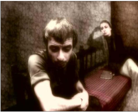
Samira Esandarfar, «Monologue Under White Light», video, 2005.