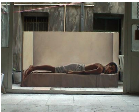
Ahmad Morshedloo, «Untitled», documentation on paintings, 2006.

TREIBSAND VOL. 01 sheds light on contemporary and emerging art in Tehran , concentrating predominantly on an analytical stance in times of waiting. Waiting for the future may be expressed as yearning or depression, or it may appear as a long, protracted period in which past and present are analysed in depth from a personal and post-colonialist viewpoint. The concept has been drawn up in close collaboration with Parastou Forouhar (Frankfurt am Main/Tehran).