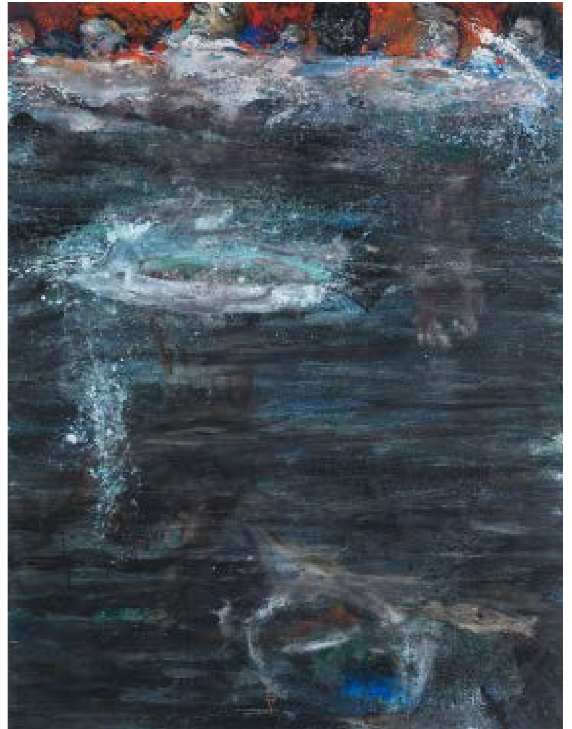
Moribund from the Haftad-o-Du-Tan series, pencil, ink, chalk pastel and acrylic on canvas, 200x150 cm, 2014