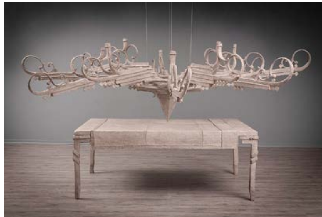
Life , papier-mâché installation, 2013-2014