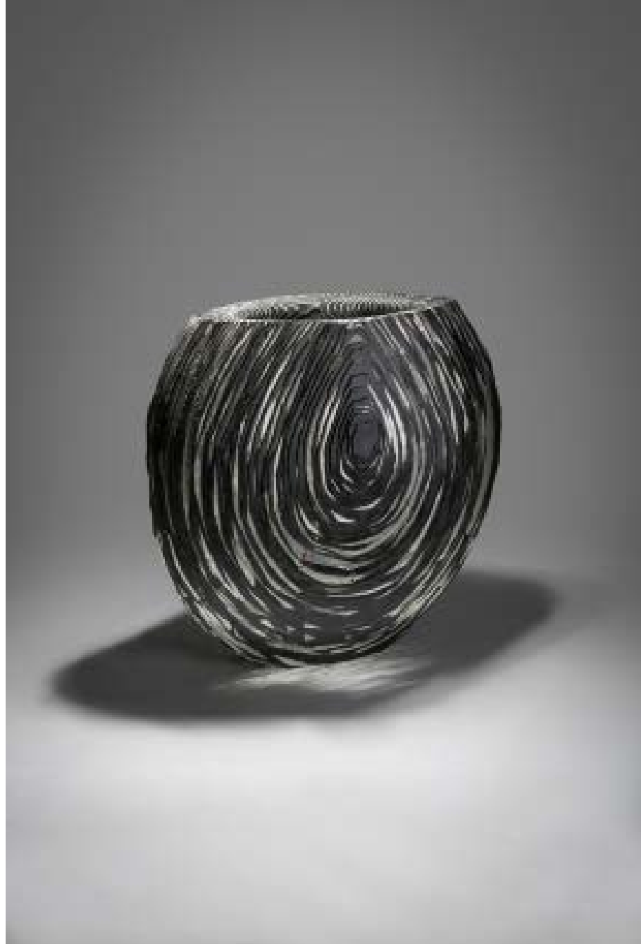
Interior , black cartonplast sheet, aluminium sheet and light, 99x106x55 cm, 2014