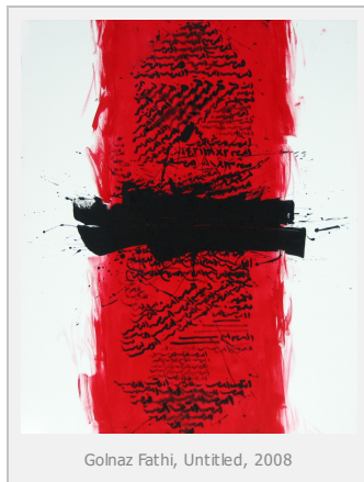
Golnaz Fathi, Untitled, 2008

The exhibition illustrates themes that range from time, a constant yet fragmented notion as depicted here, to politics. Each generation of artists deals with these themes in very different ways, but there is a shared sense of identity and heritage, expressed through reinterpretations of the Iranian creative vernacular.