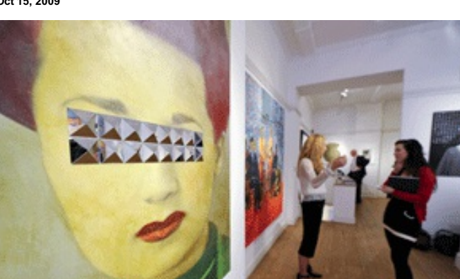
A general view of the Routes II exhibition of contemporary Mddle Eastern and Arab art at the Waterhouse & Dodd gallery.

Talent is more interesting than topography, according to the curators of an exhibition of contemporary Mddle Eastern and Arab art at London's Waterhouse & Dodd Gallery. Following on from the inaugural Routes show last year, Routes II is an ambitious new collection of established and emerging artists and demonstrates the extent to which the region's art has moved from the cultural periphery to the international mainstream.