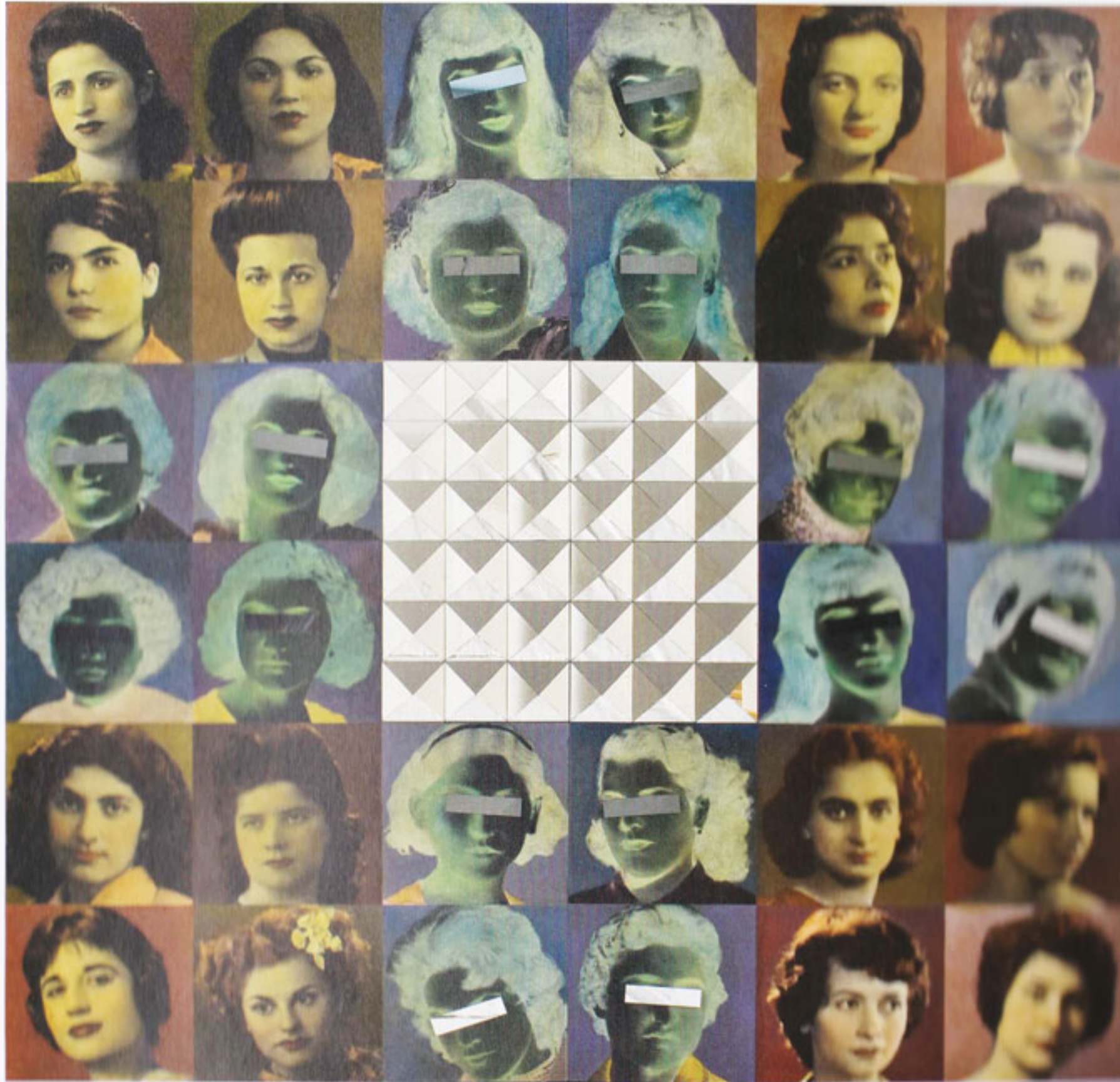
With the Passage of Time , acrylic and mirror fragments on printed board, polyptych (4 panels), each panel 90 x 90 cm, 180 x 180 cm overall, edition of 3, 2009