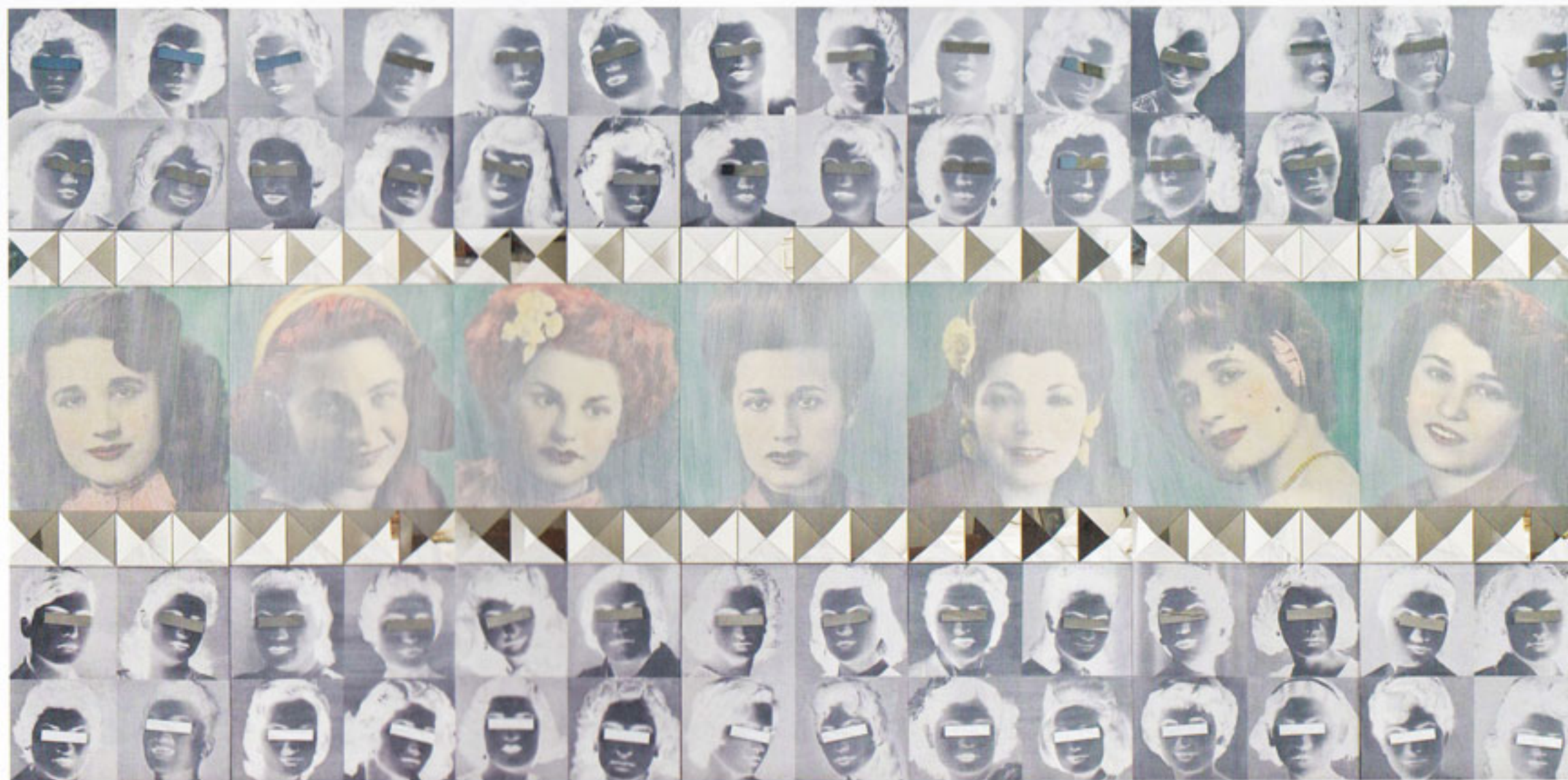
With the Passage of Time , acrylic and mirror fragments on painted board, polyptych (7 panels), each panel 140 x 40 cm, 140 x 280 cm overall, edition of 3, 2009