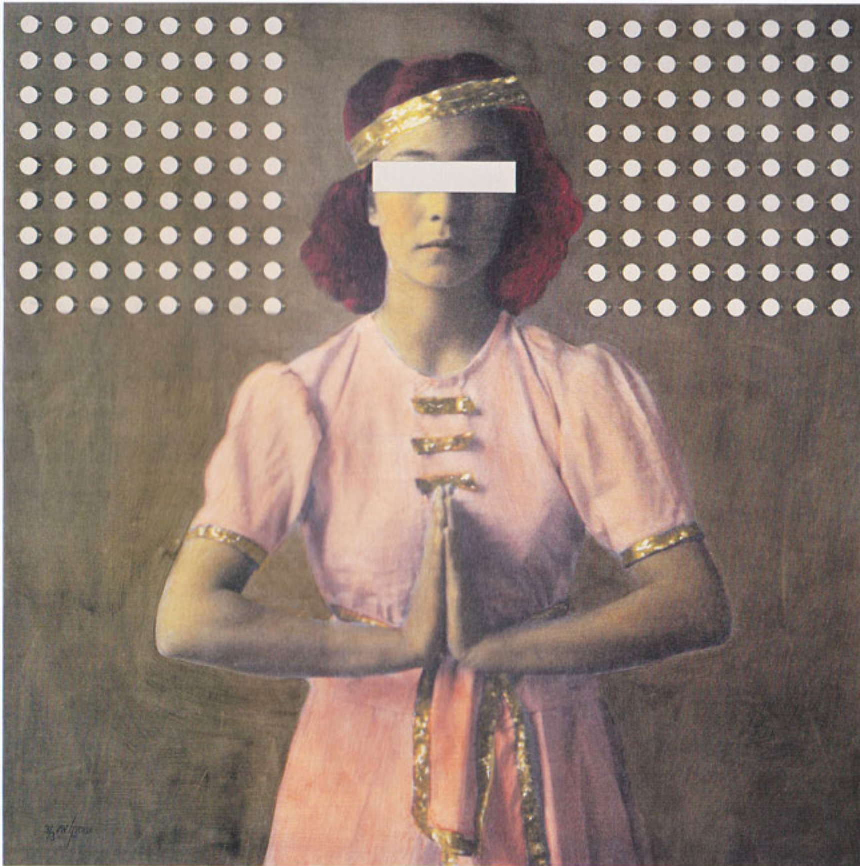
Playful Girl , acrylic and mirror fragments on printed board, 100 x 100 cm, edition 3/3, 2008