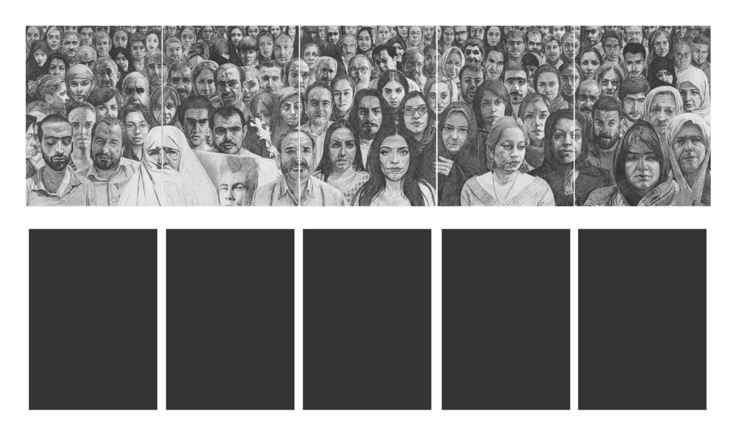
Resonance of Silence, pen on cardboard, polyptych (10 panels), 240x450 cm overall, 120x90 cm each panel